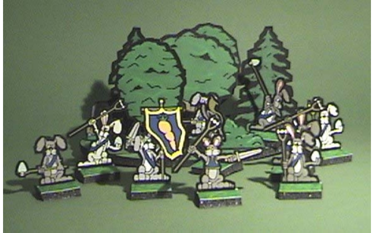
A unit of hare slingers.

The hares live in the cooler climates of the northwestern regions known only as the Warrens. There, deep beneath the ground, they thrive and grow. A Warren is vast underground complex of winding, endless tunnels and chambers. It is nearly impossible to count the number of hares that live in a Warren. Each Warren is lead by a Harearch. Though the Harearch leads the Warren, all hares within it share equal responsibility for every aspect of Warren life. Each Warren is sovereign and has little to do with the daily affairs of neighboring Warrens. In times of trouble and war Warrens will quickly unite to oppose it.