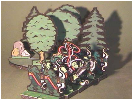
A regiment of tortoise archers.

The tortoises have two gods, Chi'ne Mai, the Mother Turtle and Te Chi'ko Li, the Eternal Dragon. They have existed since the beginning of time. Before the Earth rose from the sea. Te Chi'ko Li roamed the skies and Chi'ne Mai swam the primordial seas. When the lands rose from the seas and life crawled on to it, the two came together and created a race of tortoises. They taught their children language, technology, and art. When the time came they left their children to live their own lives bidding them only to be wise and steady to be prosperous.