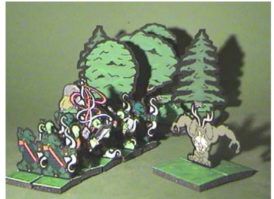
A unit of tortoise archers facing off with the dreaded jackalope

However, there are an army of living Tortoises standing on the other side of the field, determined to stop us. Ah, well... We have had turtle soup before, we will have it tonight as well.