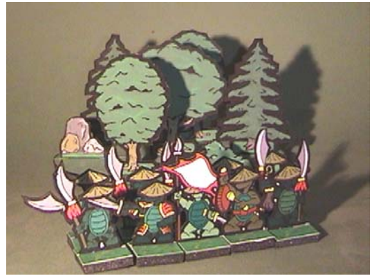
A Tortoise spear regiment ready for battle.

This does not mean they do not know their enemies, the hares. They have spent centuries studying them and have learned to expect the unexpected in battle with them. The tortoises are hard fighters and are not easily surprised. They deal with fast, unpredictable hares with a calm manner, following the advice of their most ancient and respected ancestor "Slow and steady wins the race"