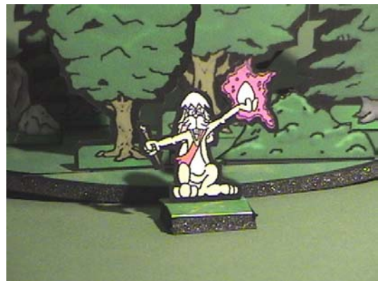
A hare ovamancer casting a spell.

Over the centuries hares have learned that by painting certain colors in certain designs on eggs they can create spells. Gifted hares are chosen young and begin training in the art of Ovamancy.